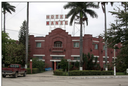
The Hotel Mante

The Hotel Mante is a very solid place to stay. Dependable air conditioning, swimming pool and a good restaurant with very pleasant people running the place. If staying at the Hotel Mante you will find everything you need within reason. If you are staying up in the mountains (i.e., El Cielo rainforest) then you should bring a sleeping bag. You will be sleeping in beds with linens but there is a possibility of bed bugs so it is wise to sleep in your sleeping bag.