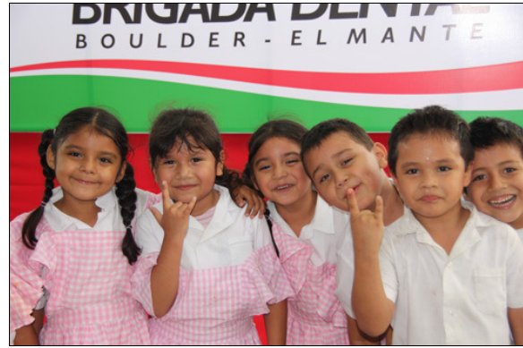
Happy school children