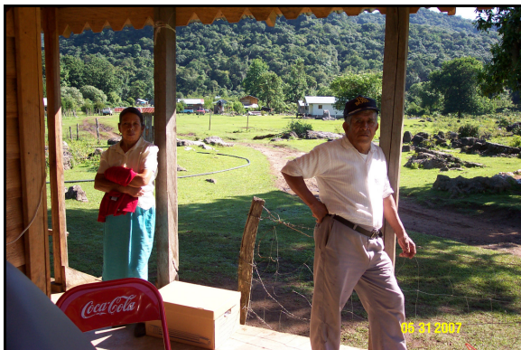
View of mountain location