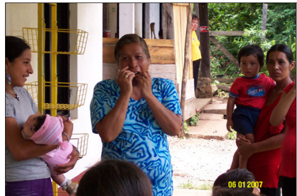
A flossing session