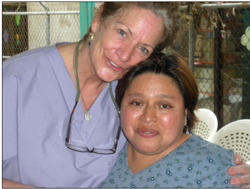
A hygienist and her patient