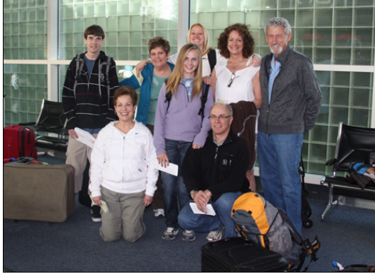
The Spring 2009 dental team